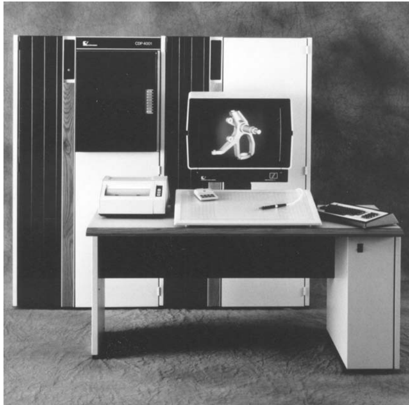
Figure 12.2 CDS-4000 System with Instaview Terminal

that an APU be part of the configuration. On occasion Computervision still referred to these systems under the Designer VX nomenclature.